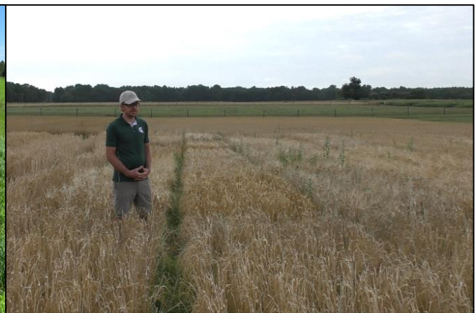
Figure 2. Hickory Corners plots near harvest