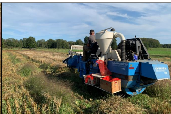
Figure 4. Harvesting plots in Chatham