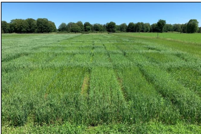
Figure 1. Chatham plots in early July