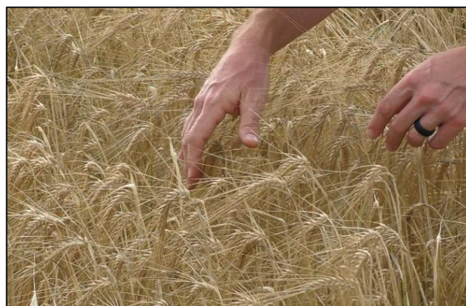
Figure 3. LCS Genie at Hickory Corners